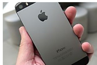
Experts shocked, as new trick saves online shoppers thousands in MegaBargain 24