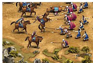
15 million players are already addicted! Forge Of Empires