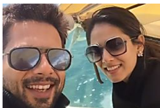
Photos of Shahid Kapoor and Mira Rajput's babymoon are making Itripto